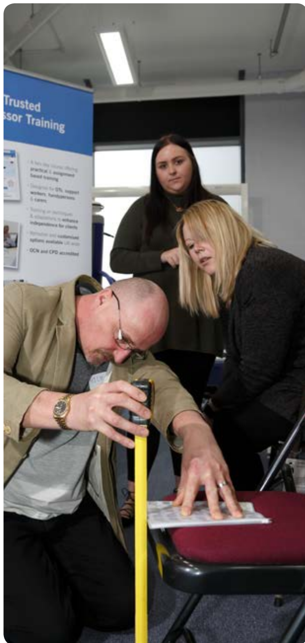
Trusted Assessor: New thinking for a new era