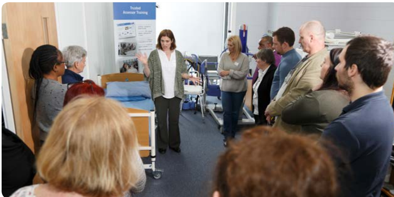
Trusted Assessor: New thinking for a new era

The Trusted Assessor role is not designed to replace Occupational Therapists but to compliment them by giving time for them to complete more complex assessments.