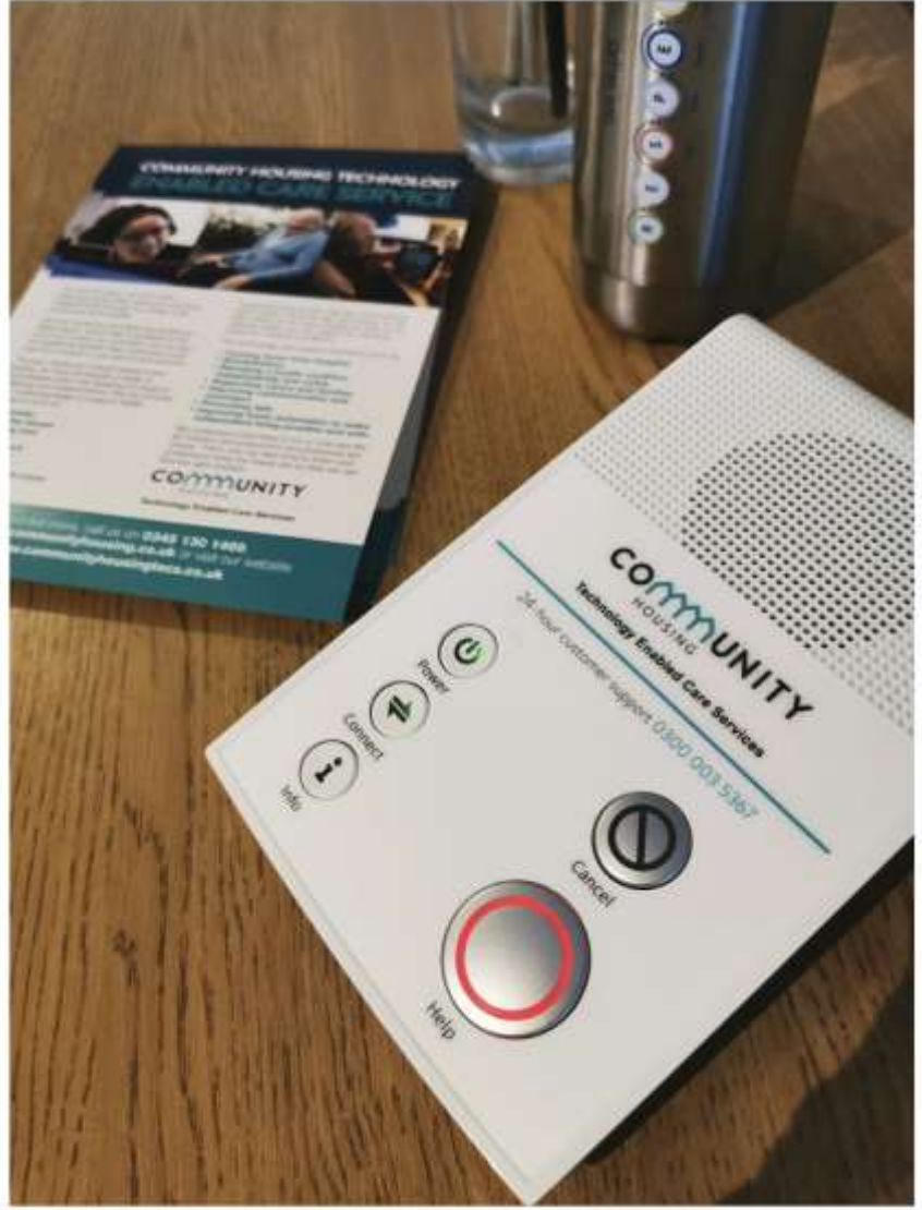
How good do Community Housing TECS 's new Chiptech UK Seven units look 🤖? New branding looks great!

Dedicated Account Support – Our account management team have a wealth of experience from a service provision perspective, from installation to monitoring, TEC development and Team Leaders, they have the knowledge and understanding to help you every step of the way